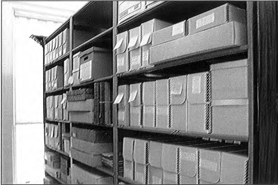
Stacks at the Drew Archives, Duxbury, MA