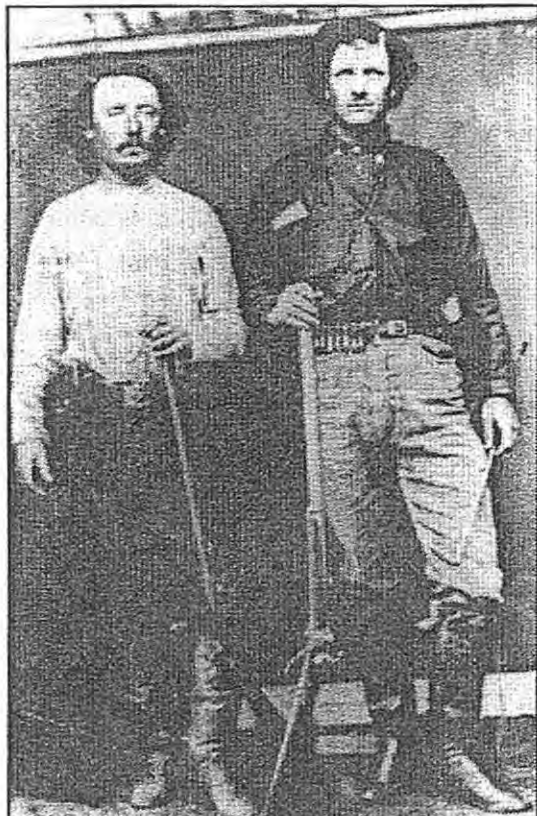
Bill Tilghman (right) posing with a gun. Tilghman later led the raid on Cimarron for Soule.