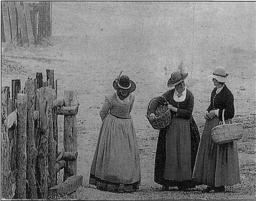
Scene from Plimoth Plantation

Soule Kindred in America, Inc. 53 New Shaker Road Albany, NY