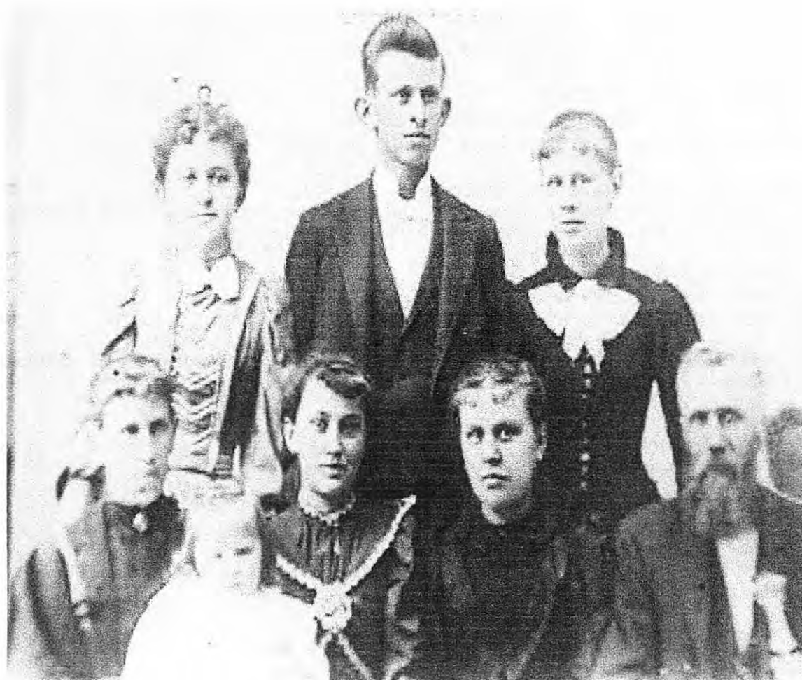
Ady Family Portrait