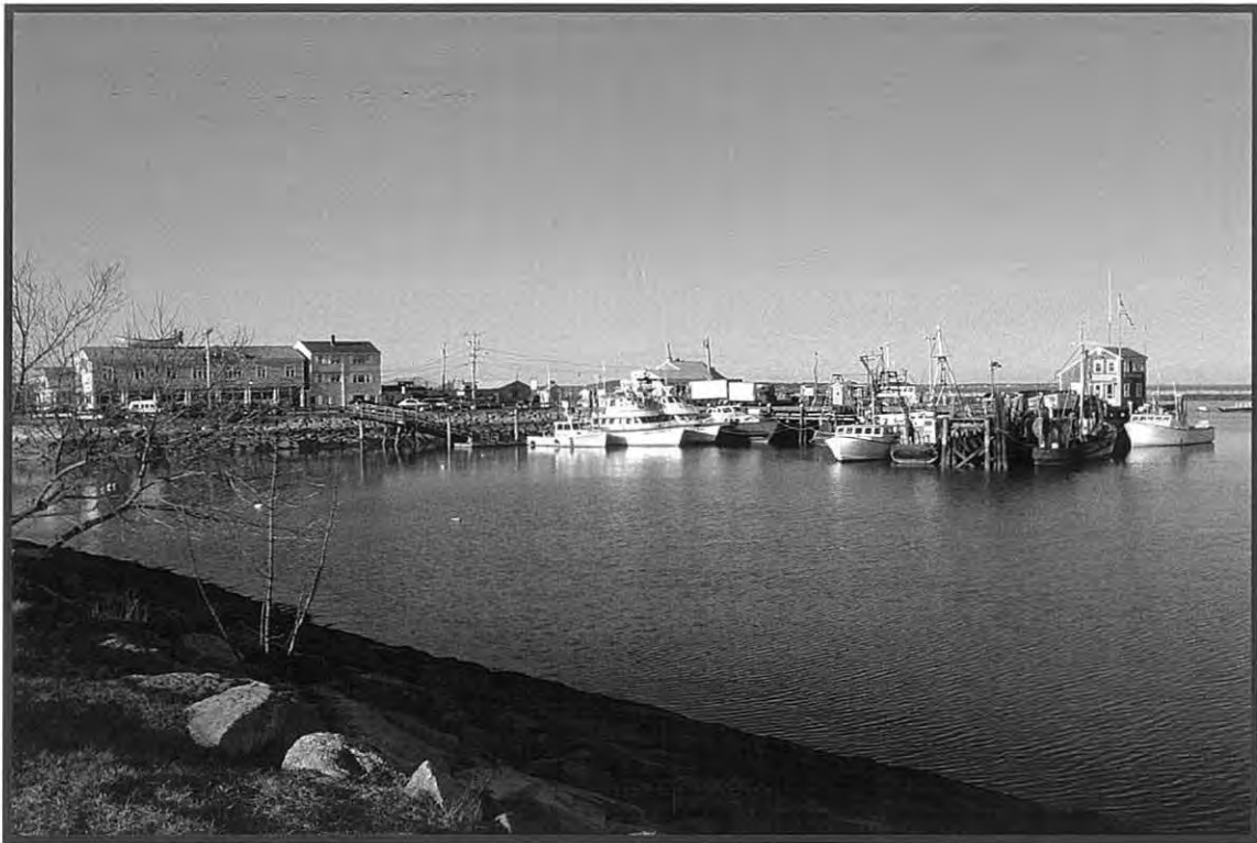
Plymouth Harbor in Winter, Plymouth, MA