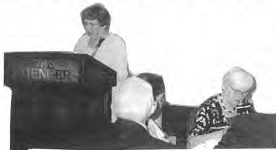
Soule Kindred in America, Inc.