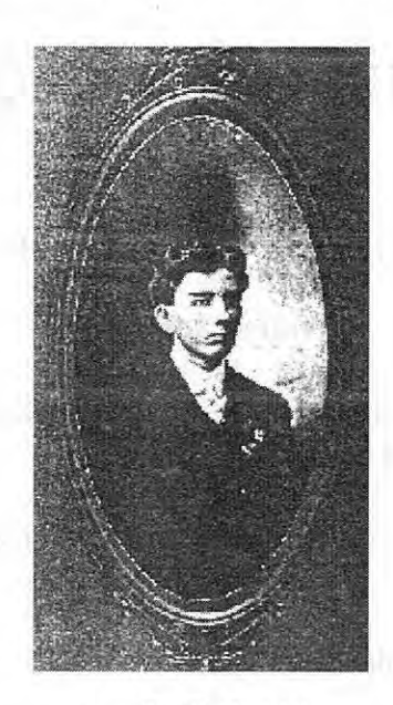
By F. F. SOWL

With a little bit of laughter With a little bit of song Broken hearts are mended Heartstring ties made strong.